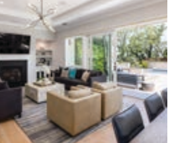
224 Seclusion Valley Way, Lafayette 5 Bed | 4.5 Bath | 3,828 SqFt | .79 Acres 224 SeclusionValleyWay.com