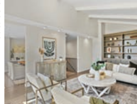
6430 Valley View Road, Oakland 3 Bed | 2 Bath | 2,634 SqFt | .22 Acres Represented Buyers